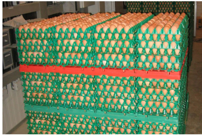
Storage of eggs.