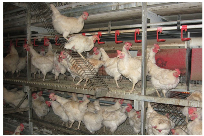
Aviary system (Photo: Thea van Niekerk, WUR).

Housing systems influence bird behaviour, especially if hens in cages and non-cage systems are compared. Birds in noncage systems will spend more energy on movement, which may result in either smaller eggs or reduced yolk content. Contamination of shells with microorganisms is higher in non-cage systems since more eggs tend to be laid outside nest boxes and the interactions between active hens and bedding material increases dust in the atmosphere which is a carrier of microbes and thus contamination.